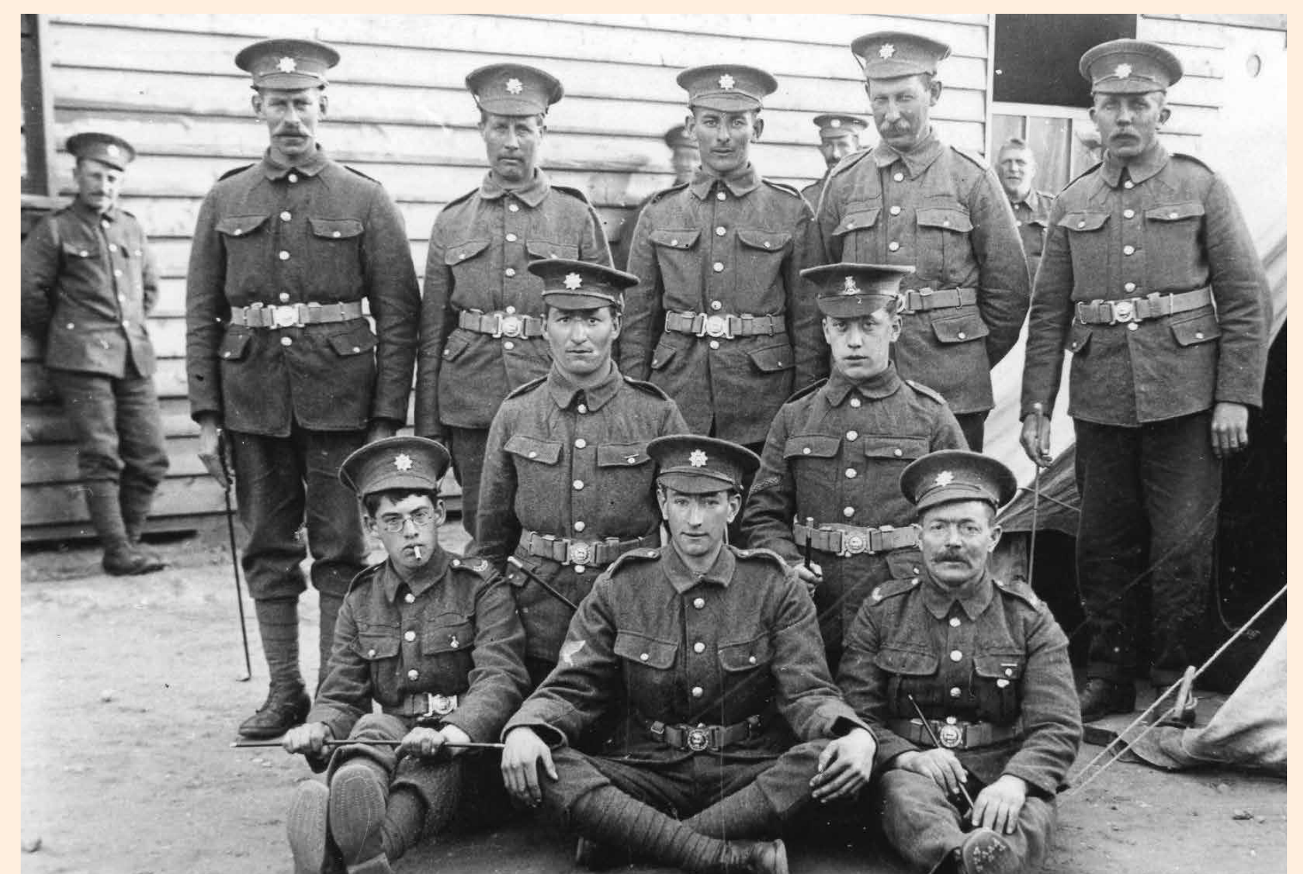
A group of soldiers at Wareham Camp.

The men were trained in trench warfare at Seven Barrows Farm, north of the town, and at Gallows Hill near Bere Regis; horse-riding, including driving wagons (motor transport hardly existed then); bridge building on the rivers, and marching.