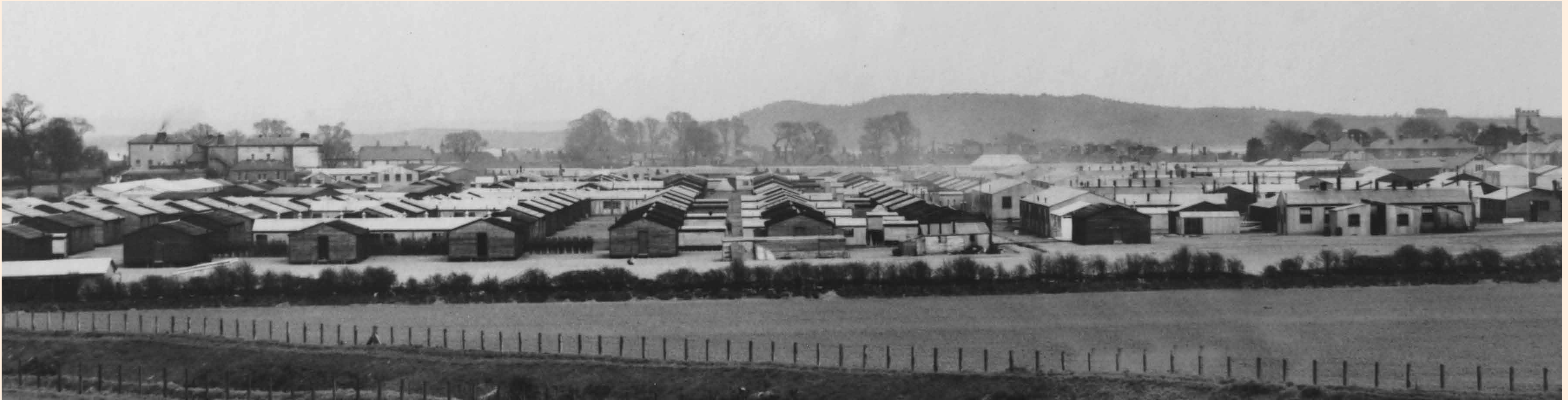
View of Wareham Camp from Worgret in 1915/16. The building left of centre is Robert Christmas House (then the workhouse), Arne Hill is in the centre, and the railway is in the cutting in the foreground.

At the time of the outbreak of the war, Wareham was a small town of just over 2,000 people. The town was transformed during the war by the huge military camp built on the outskirts of the town, on both sides of the Worgret Road. It was known as Wareham Camp or Worgret Camp. Military training for units of the Territorial Army had taken place in the Wareham area for more than 50 years, because of the wide open spaces and easy access by train. These camps were tented, and temporary; the wartime Wareham Camp was built of wooden huts and existed for about eight years.