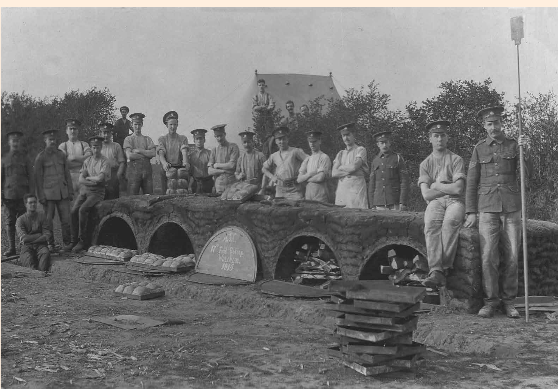
An Army Service Corps field bakery at Wareham Camp in 1915.

The camp closed in about 1922 and its operations transferred to Bovington. Many of the huts were sold off to be used as village halls in the area. Few traces of the camp survive, but the route of the railway siding and parts of the sewage works can still be seen.