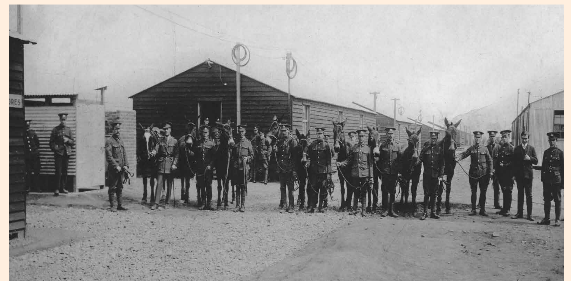
West Yorks Transport at Wareham Camp in 1915.

Regiments from all over England, also from Australia and New Zealand (Anzacs), were based at the camp at various times during the war.