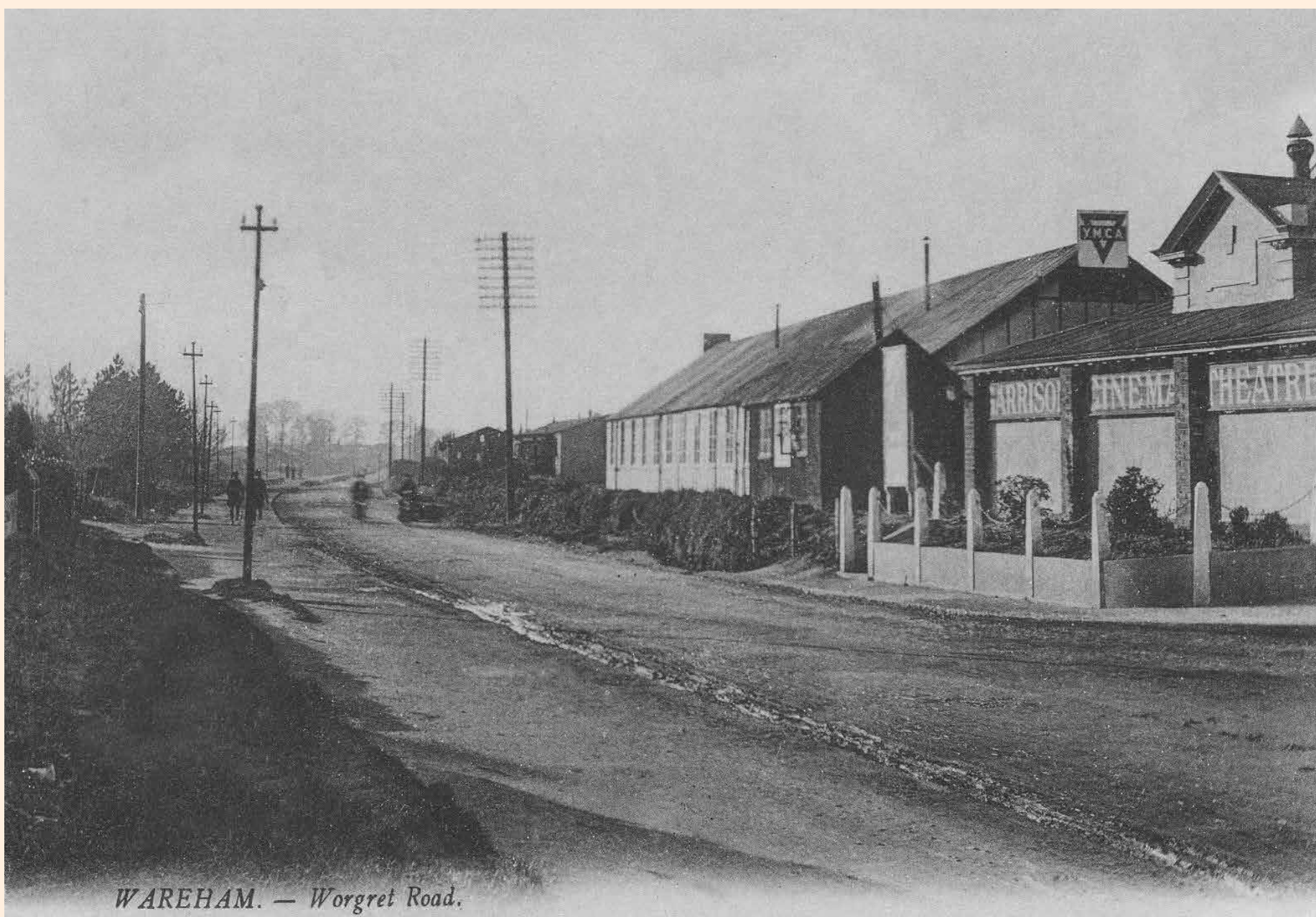
WAREHAM. — Worgret Road. The "Garrison Cinema Theatre" and the YMCA clubhouse on Worgret Road, looking towards Worgret. The buildings were on the left side of the entrance to what is now the site of Wareham Middle School.

Six hundred men arrived by train in Wareham to find that no preparations had been made for them. It was raining heavily and they were all soaked. Until tents arrived, they were accommodated in halls, churches, schools and private houses, and the townspeople provided blankets, food and cigarettes.